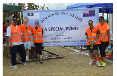
Walkathon 2015 (Report by Basharat Khan)