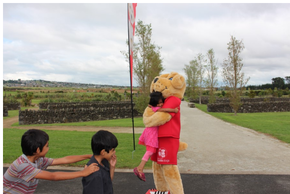
Family Day Out 2015 Fun at Barry Curtis Park