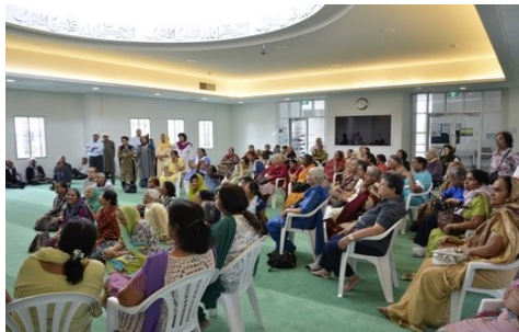
100 members of Shanti Niwas Charitable Trust visited Baitul Muqet on Tuesday 3rd March