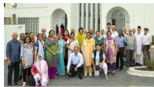
Page 4 of 4